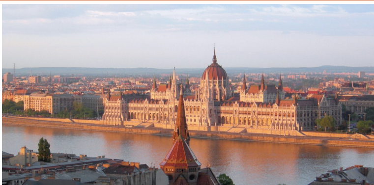
The Parliament along the Danube in Budapest

Tel: +32 2 227 13 70 Fax: +32 2 219 81 18 E-mail: eunec@vlor.be http://www.eunec.eu