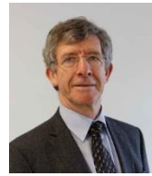
Frédéric Reiss (LR)

Deputy from Loiret's 6th district, member of the National Assembly's Cultural Affairs and Education Commission