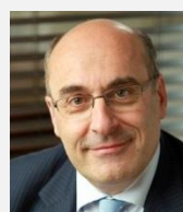
Jean-Léonce Dupont (UDI-UC)

Senator of Gironde, vice-president of the Senate, member of the Senate Culture, Education and Communication Commission, delegated vice-president of the Senate Socialist Group