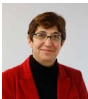
Valérie Corre (PS)

Senator of Calvados, Senate quaestor, member of the Senate Culture, Education and Communication Commission, president of the General Council of Calvados