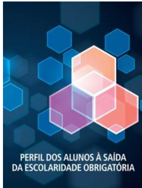
The Profile of Students Leaving Compulsory Schooling.